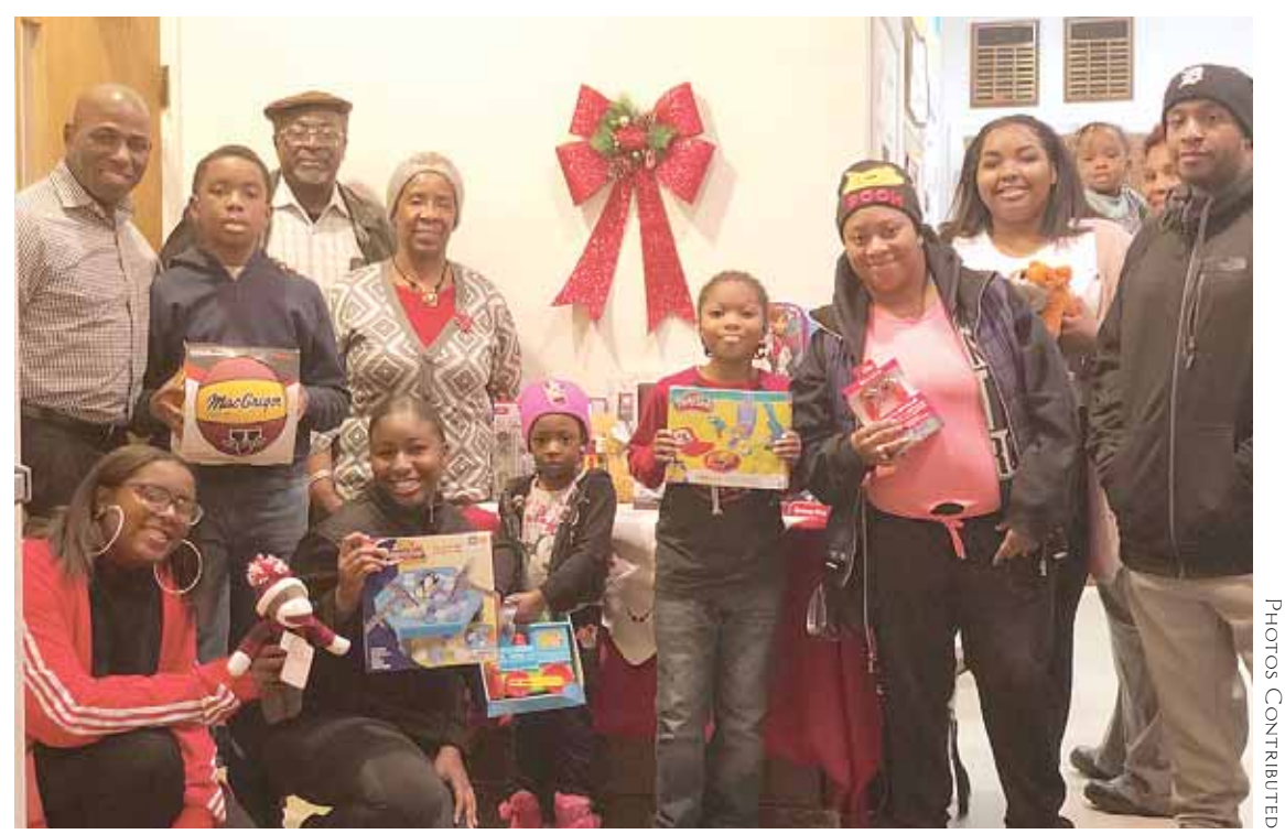
Members of Shiloh Church of God in Christ pose with some of the toys collected during the Toys for Tots drive.